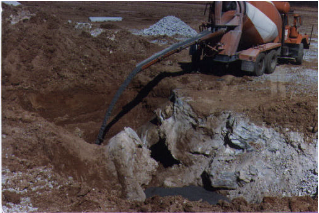
Fig. 4 – Placing grout to seal off the throat of a sinkhole exposed by dynamic compaction

Another site improved by dynamic compaction was in Knoxville, Tennessee. The site had been graded several years before and had been left unattended, resulting in subsurface erosion and sinkhole development. Several of the observed sinkholes were large enough to hold a pick-up truck. Dynamic compaction was used to locate and collapse as yet undeveloped sinkholes, as well as to correct the existing sinkholes. In addition, several of the sinkholes within the building area required special attention. These were plugged with concrete and then backfilled with alternating layers of compacted fill and geotextile. Following completion of site improvement, the site was developed with a large Wal*Mart.