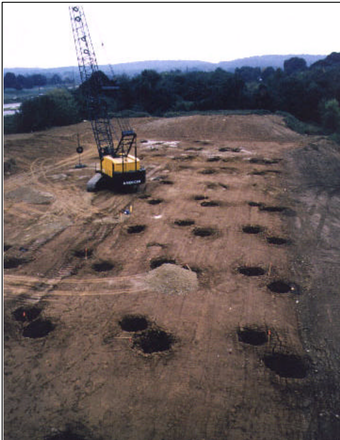
Fig. 3 – Valley Forge building site

Repeated high energy impacts using weights of 8 to 20 tons dropped from heights of up to 70 feet are used to first locate the domes. Once a dome is located, additional high-energy impacts are used to collapse the dome. Granular material is used to backfill the craters, and the area is repounded until an acceptable response is achieved. Dynamic compaction has been successfully used for sinkhole correction in a number of states, including Florida, North Carolina, Virginia, Missouri, Pennsylvania, and Tennessee. Several building sites have been treated by dynamic compaction in the Valley Forge area of Pennsylvania. On one of the sites, on which a three-story building was to be constructed, cumulative crater depths of up to 14 feet were achieved in areas of known solution activity. For this particular site, a predetermined grid pattern was used at the column locations to achieve maximum densification beneath the foundations. Figure 3 shows the first phase of crater development at footing locations on this project. Pre-existing domes in the overburden soils that were filled with air or soft clay were eliminated by dynamic compaction.